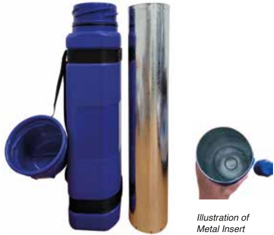
Illustration of Metal Insert

Colour of electrode rod holders are for illustration. Colour may change.