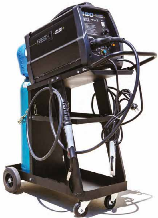
OME90105 WITH MACHINE

For demonstration only - machine is not included in the cost of the Trolley