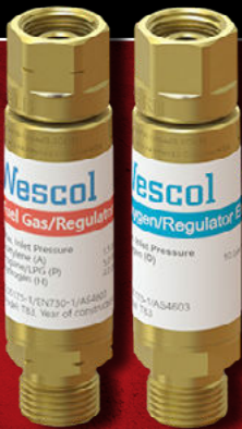
FBARAC FUEL GAS