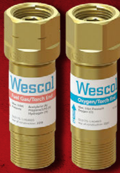
FBATAC FUEL GAS